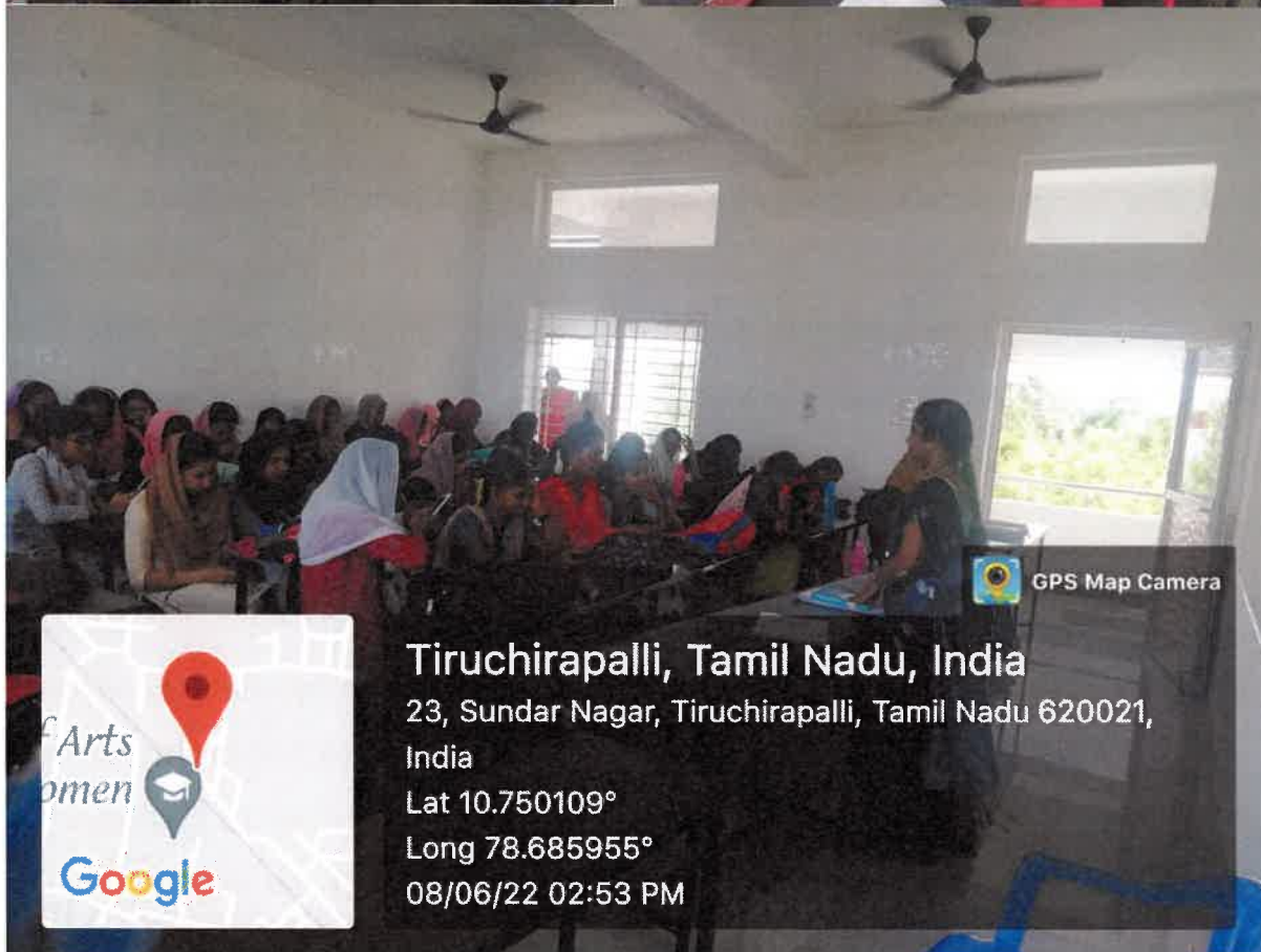
Students attending Session II - Lecture II, supervised by their respective class Staff.